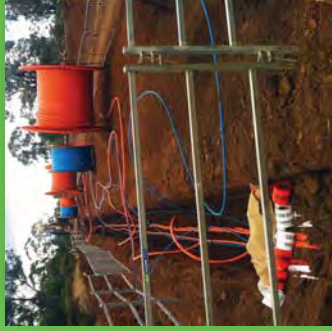
Piping & Electrification Network Installation LV & HV