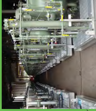
Offshore / Onshore Fabrication