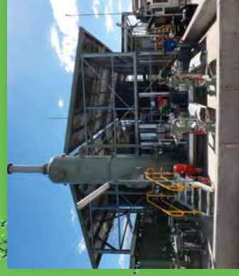
Surface Facilities Installation