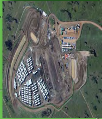
Early Works, Camps, Lay Down Installation & Materials Management